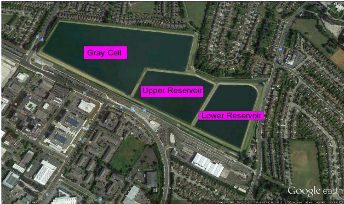
Figure 3-2 Existing Scheme Layout

The nature of the existing development being active storage reservoirs means that they should be periodically drawn down for inspection and maintenance works. Therefore, their physical nature and appearance are subject to variation depending on the maintenance requirements associated with drinking water reservoirs.