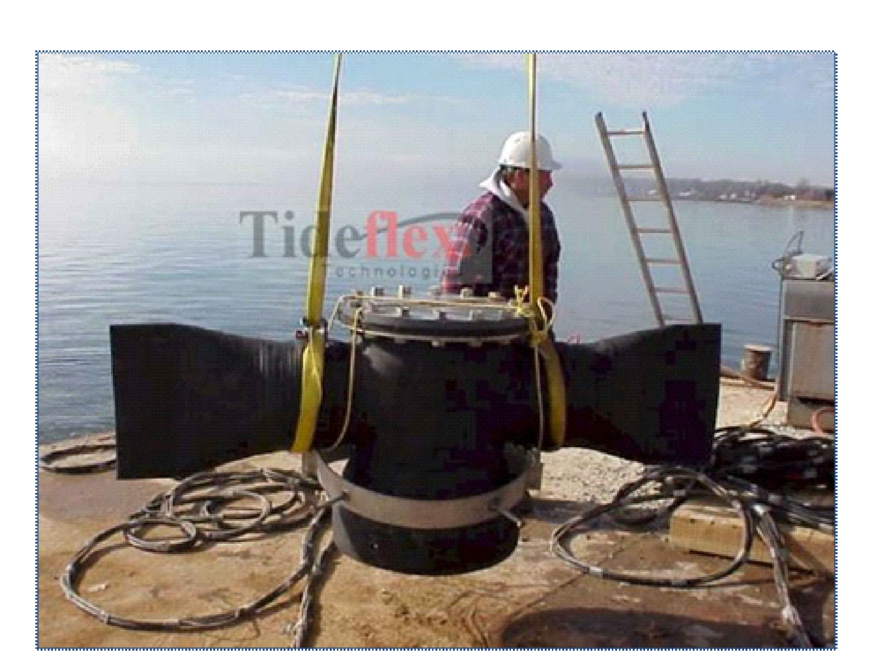
TYPICAL DIFFUSER VALVE