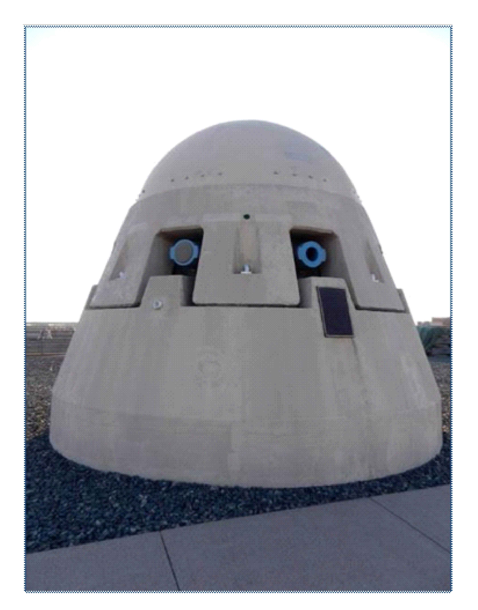
TYPICAL MARINE RISER & DIFFUSER SYSTEM