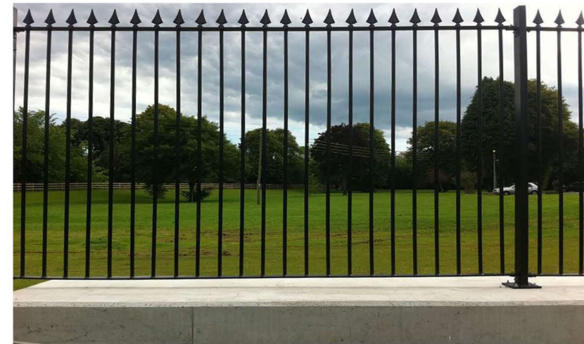
Fig.1 - Ornamental system railing security fence. Circa 2.5m high