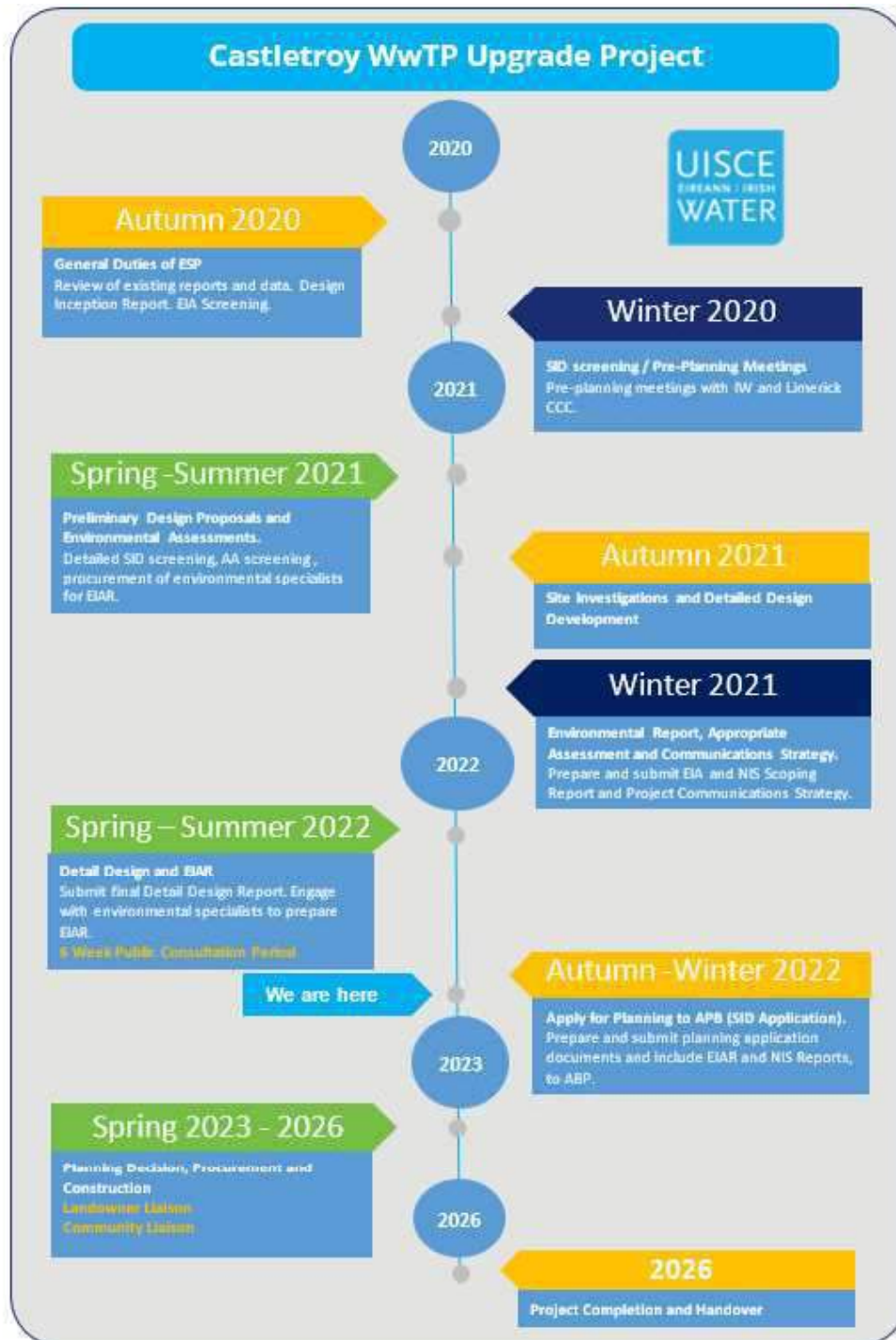
Figure 4.1: Project Roadmap

A project roadmap has been used as a mode of communication to update about the current status of the upgrade project. From Figure 4.1 we can see the current status of the project. The next stage of project development is the application for An Board Pleanála. This includes the preparation of the planning application along with the EIAR, NIS report and the consultation report to the APB. This would be followed by the planning decision and the succeeding steps as shown in the road map.