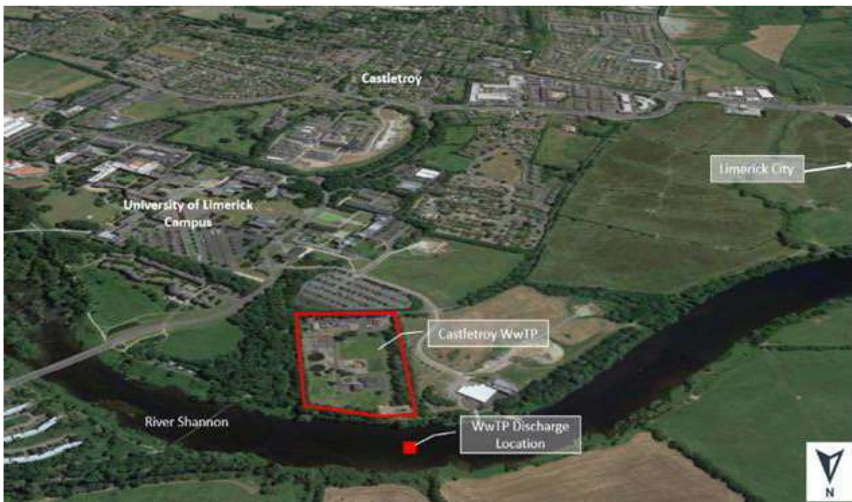
Figure 1.1: Castletroy WwTP and Discharge Point Locations

Castletroy is a Limerick suburb situated approximately 3km east of the City Centre. Castletroy WwTP is surrounded by the University of Limerick campus and the Lower River Shannon that runs past its northern boundary, Figure 1.1. The existing Castletroy WwTP operates as a conventional secondary treatment activated sludge plant. The WwTP discharge point is the Lower River Shannon which is designated both a Special Area of Conservation (SAC) (Lower River Shannon) and a Special Protected Area (SPA).