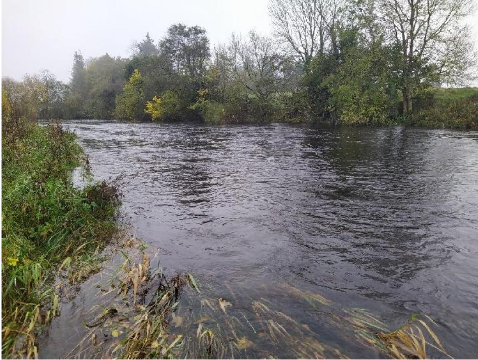
Ballymore Eustace upstream