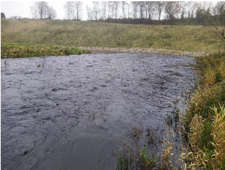
Ballymore Eustace downstream