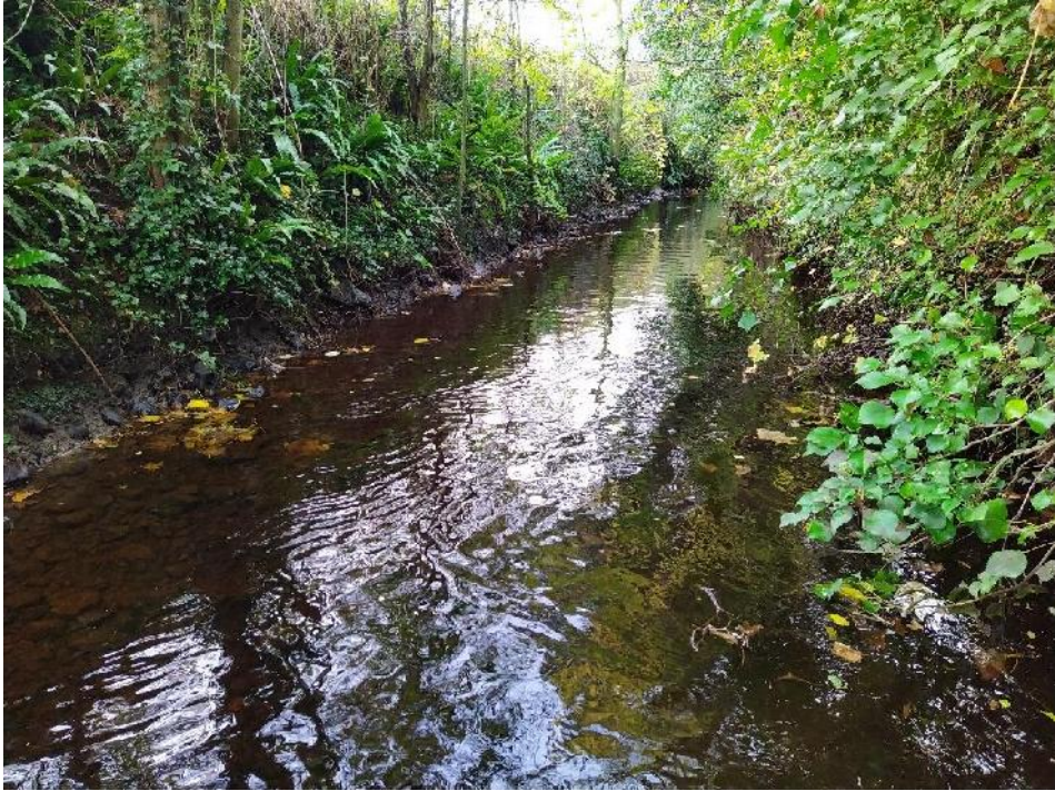
Coill Dubh upstream