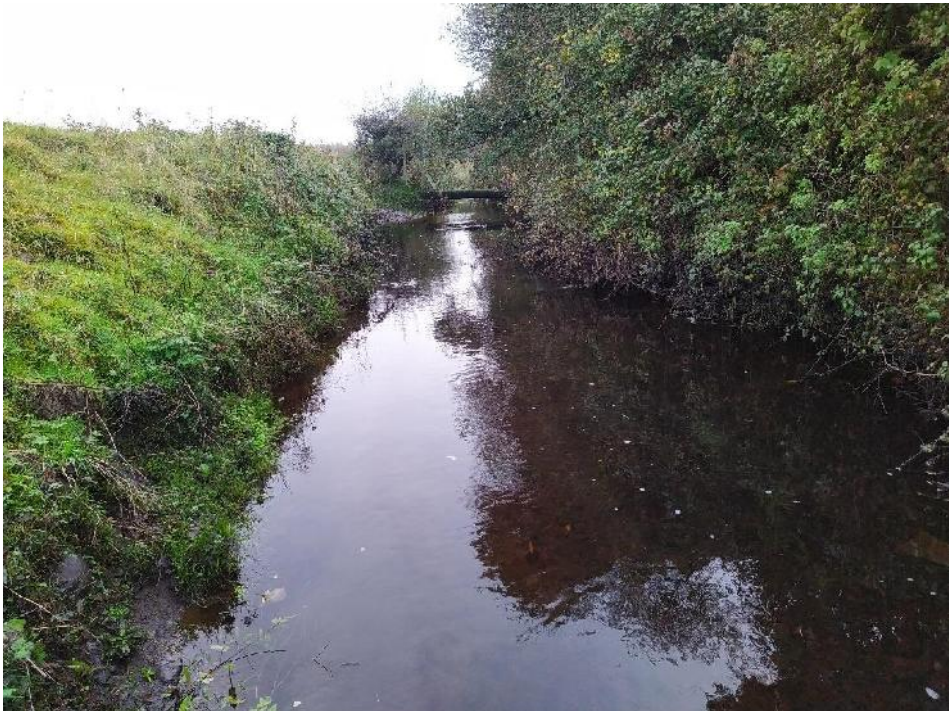
Coill Dubh Downstream