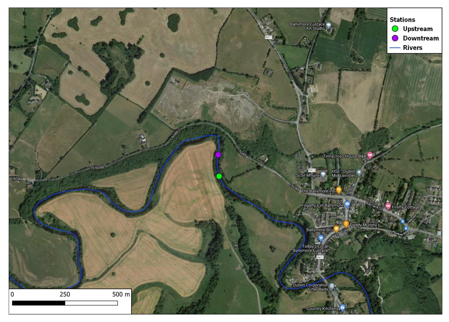
Figure 2.1: Ballymore Eustace SSRS sampling sites.