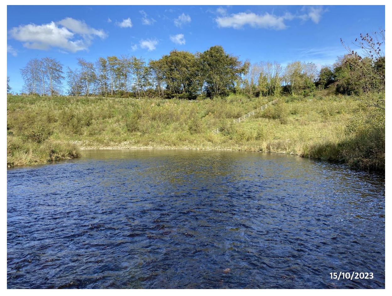
Ballymore Eustace upstream