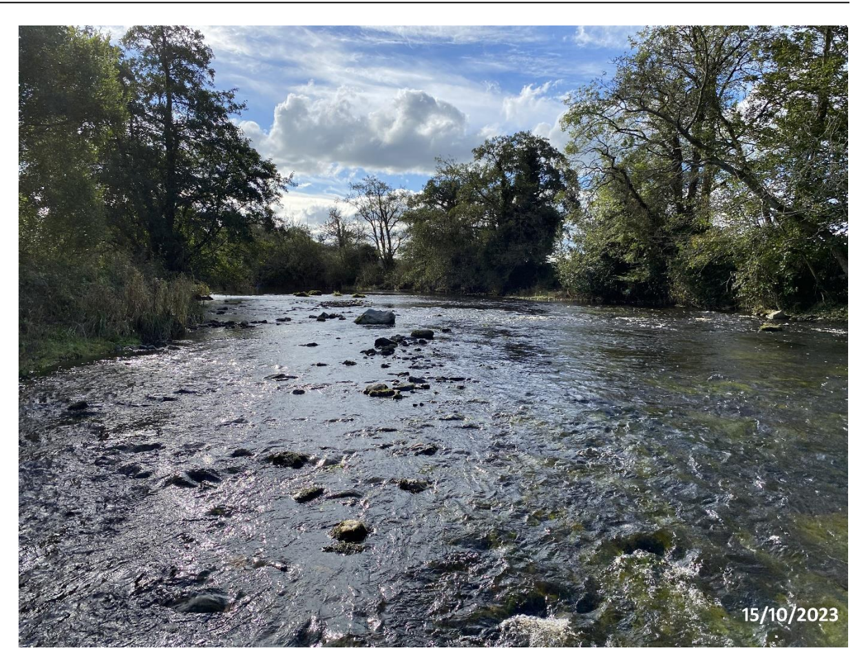
Ballymore Eustace downstream 1