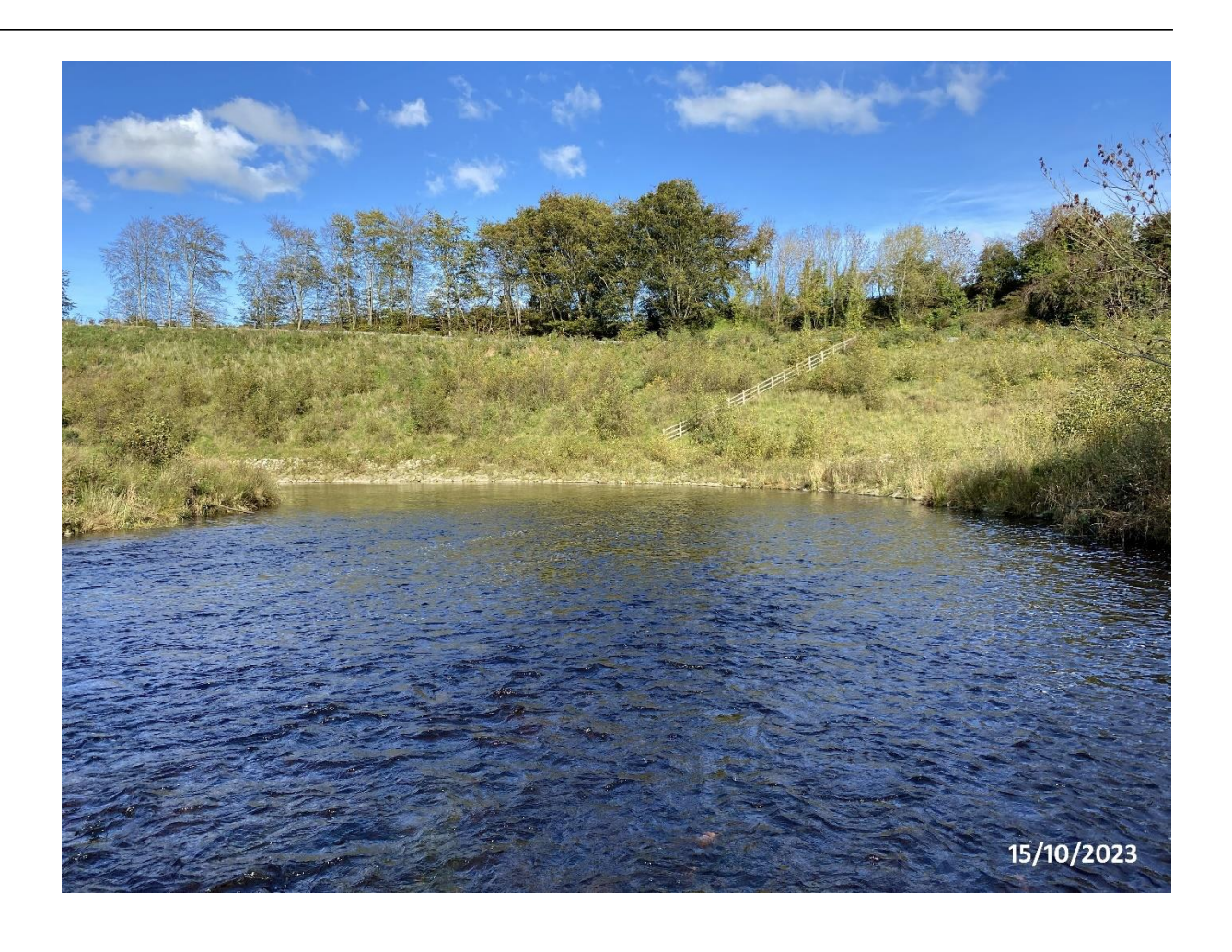
Ballymore Eustace downstream 2